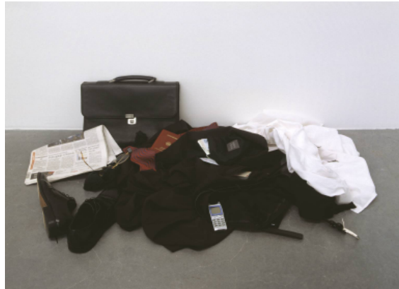
Pawel Althamer (born 1967)